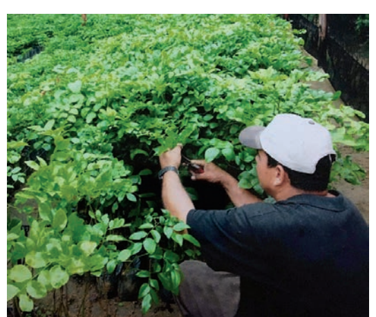
After 3 years they moved to the forest